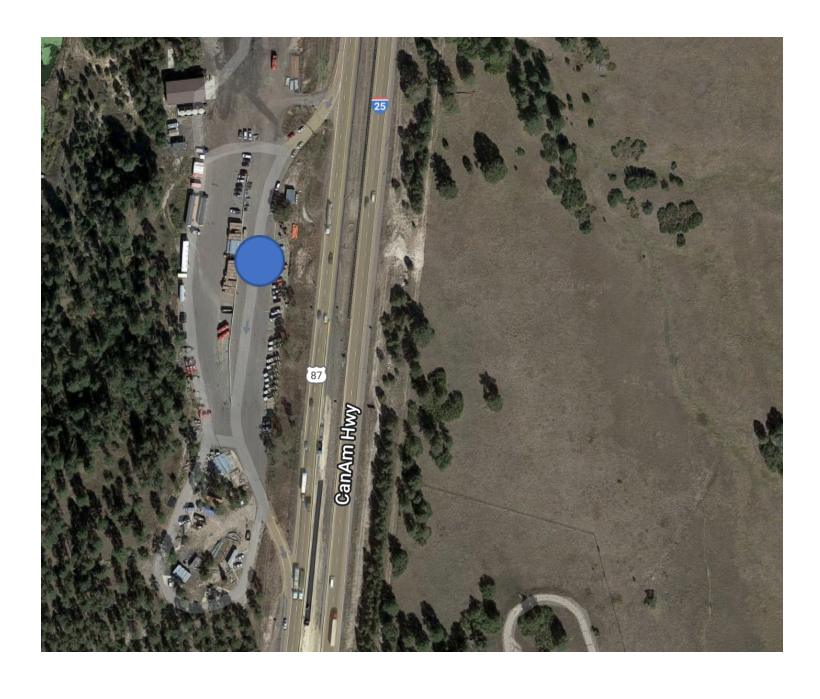
Southbound I-25 Chain-Up Station (Just south of the Upper Lake Gulch Road interchange)