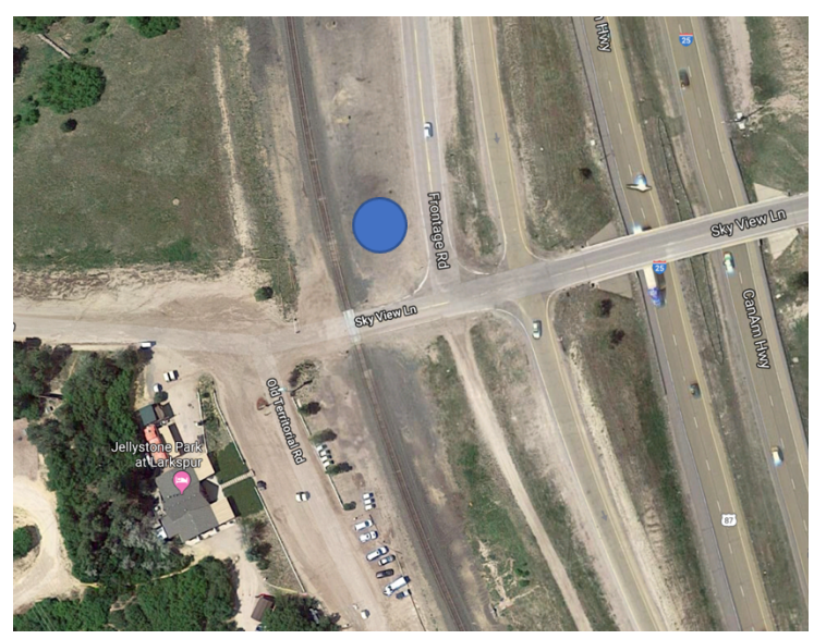
Sky View Lane/Tomah Road Lot (Near Jellystone Campground)